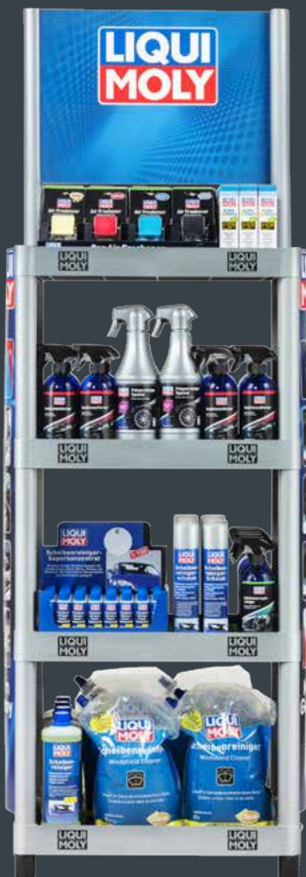
Example configuration for car care Futura plastic rack.