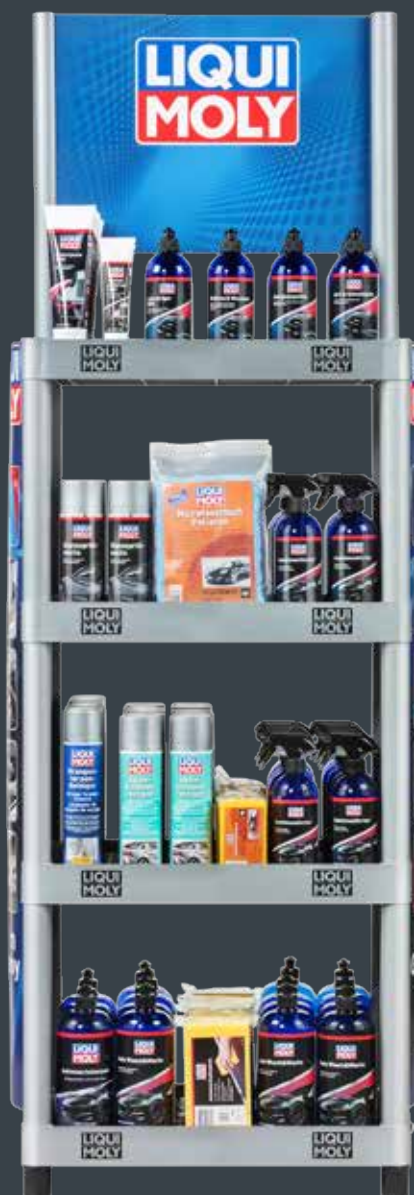
Example configuration for paintwork care Futura plastic rack.