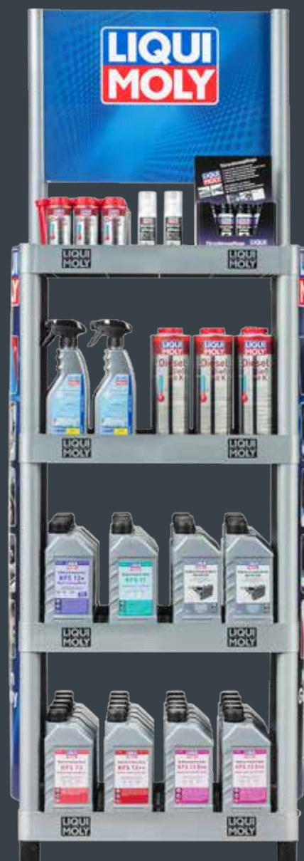
Example configuration for winter products Futura plastic rack.

We will create an individual configura- tion to meet your needs.